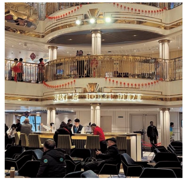
Tourists are seen on the cruise ship.